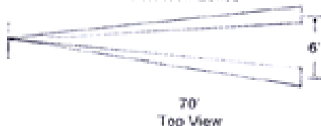
70' Top View